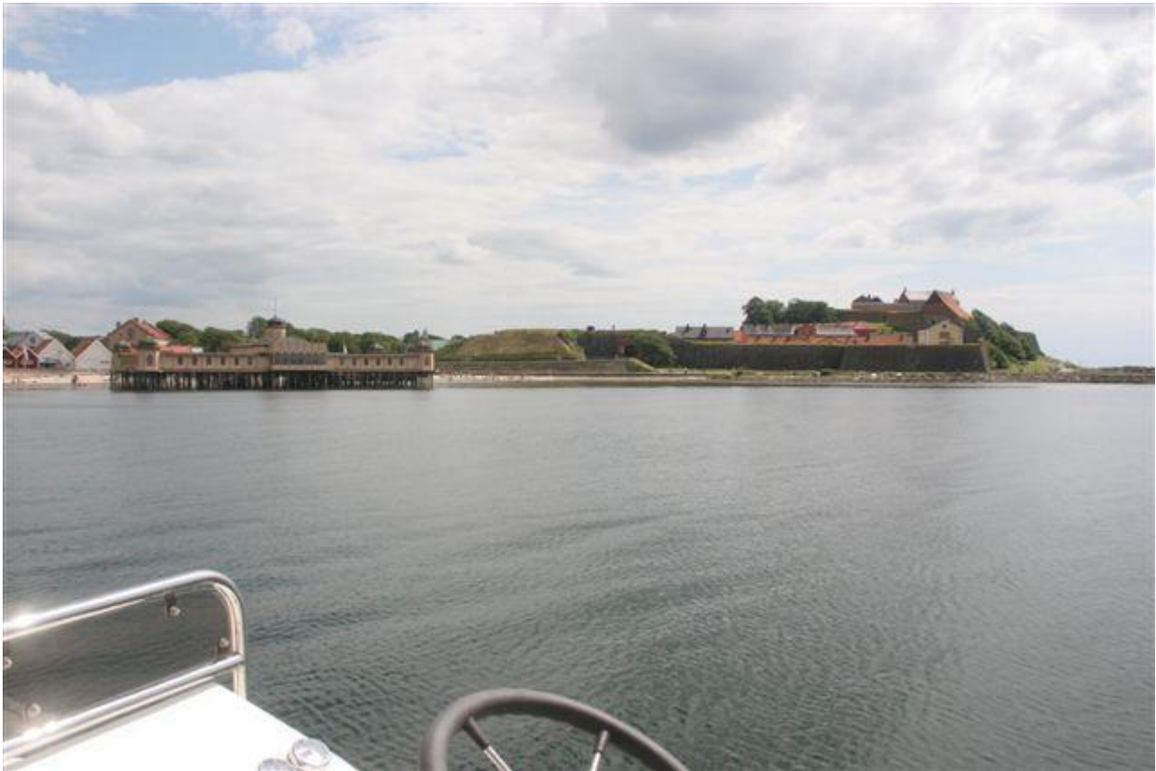
The castle and the old bath house in Varberg.

- I am now in Getteröns Bathamn on the west side of Varberg.