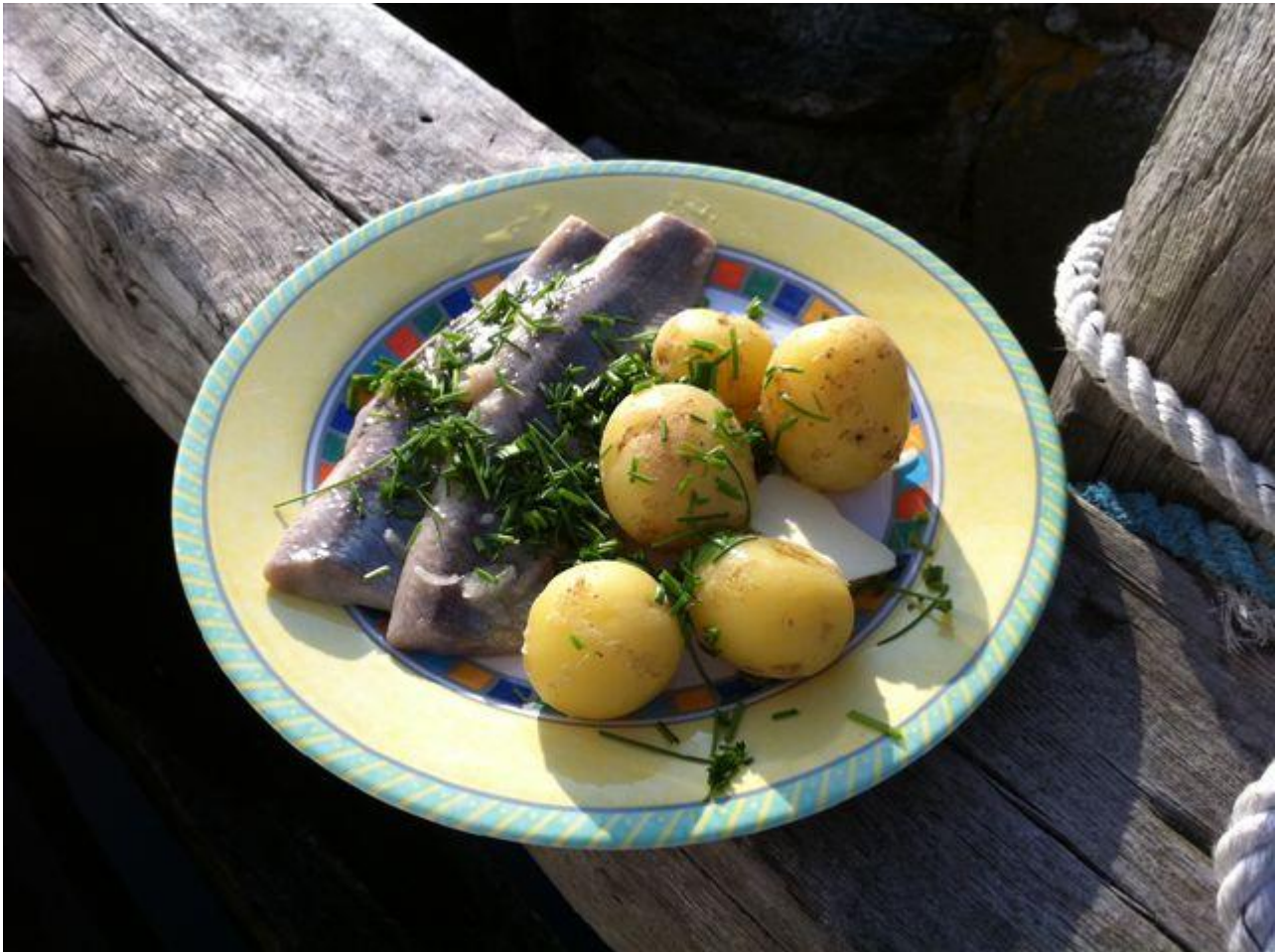
Herring with fresh potatoes, butter!

I plan to be in Dragör, close to Copenhagen tomorrow at 1700 hrs