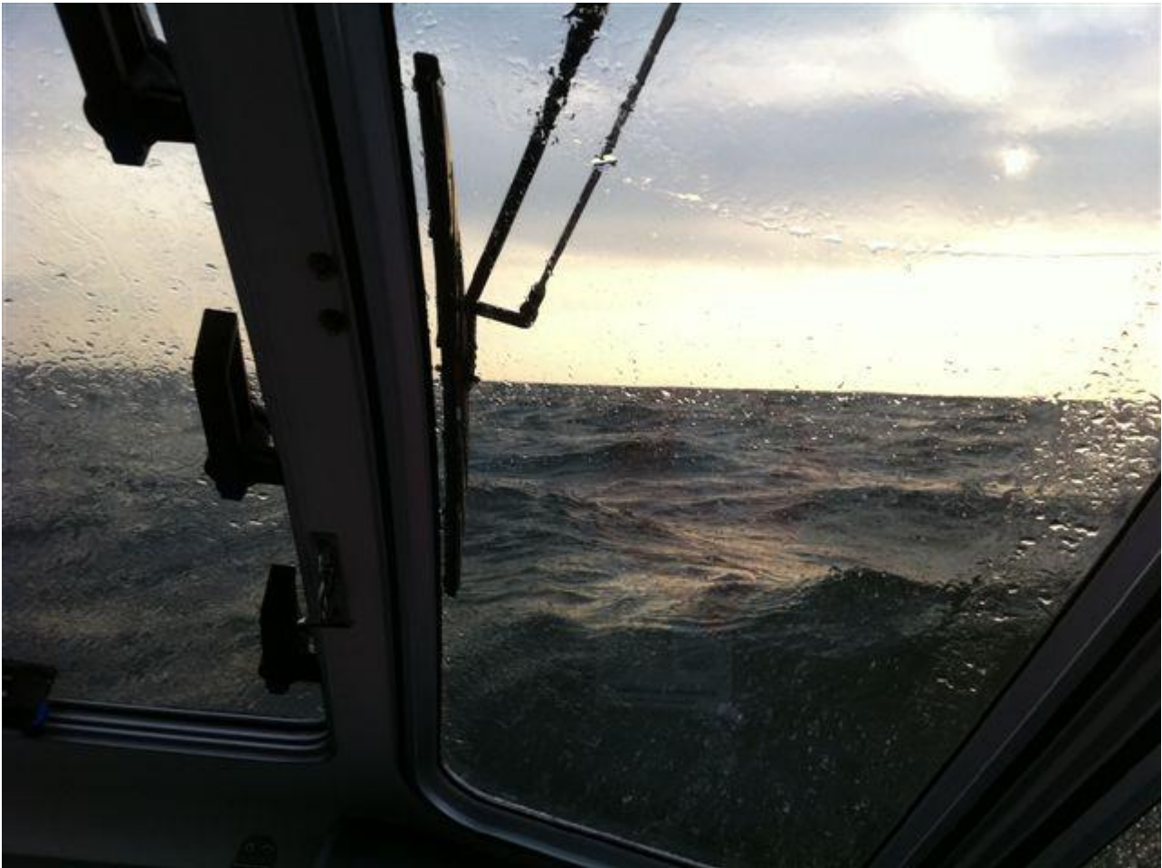
rough seas later in "Greifswalder Bodden"

In the evening, our young shipmate was at the helm up the "Strelasund" to the city of Stralsund where we arrived at 2300 hrs