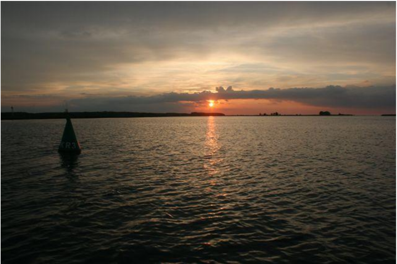
Sunset at Kröslin.

Here we enjoyed a quiet evening and after refuelling in the morning the 7th, continued the journey towards the city of Stettin in Poland.