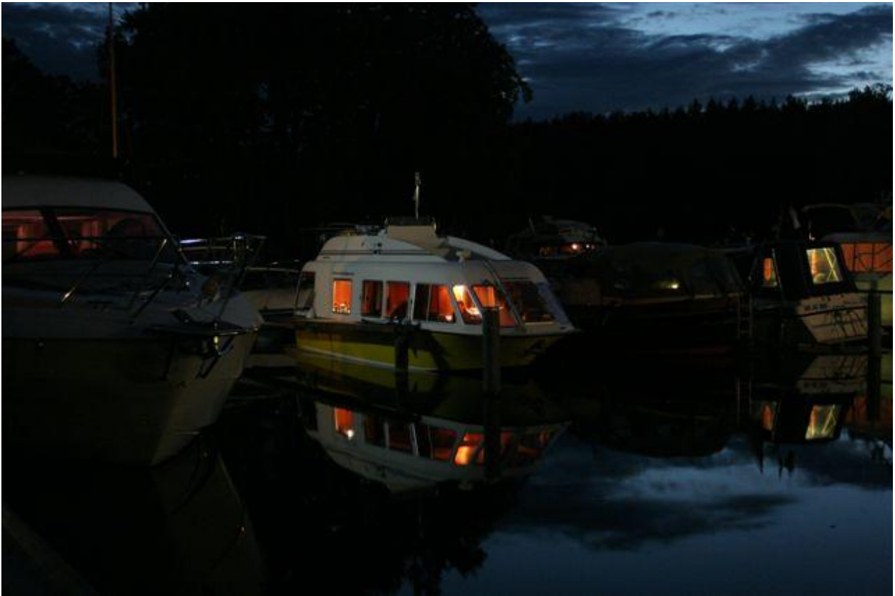
Evening in Marien Werder.