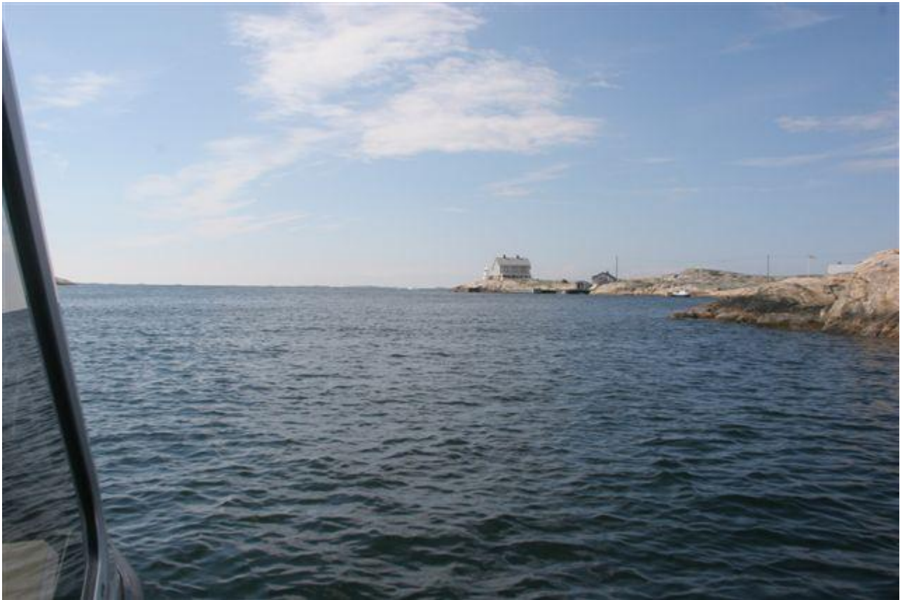
Marstrand light house.

What a beautiful day it was. How can one not be fascinated by the nature here!?