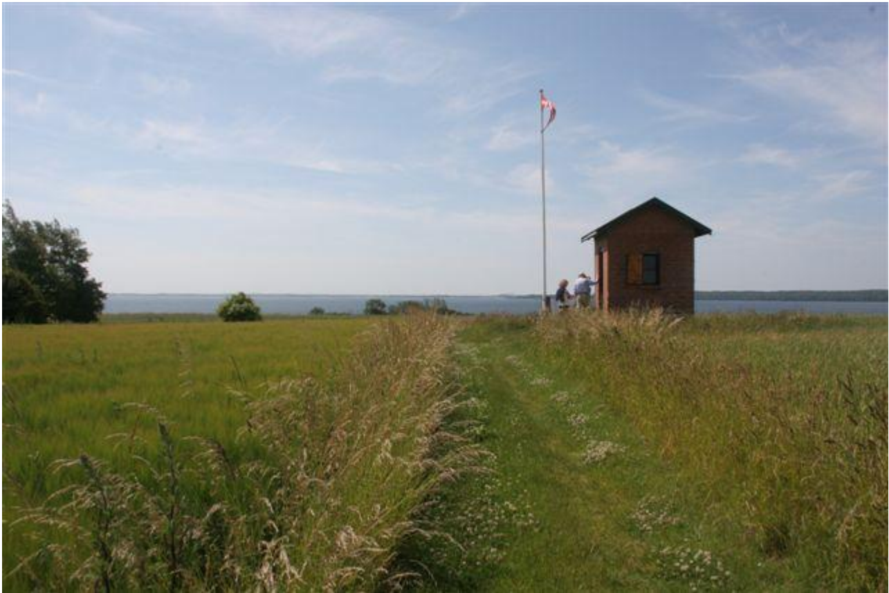
Old pilot look out on the island of Nyord.

Left Nyord shortly after noon and am now in Dragör/Copenhagen after a fine trip across the “Fakse Bugt” and “Köge Bugt”. 2,5 hrs with an average speed of 18 kts. Fine cruising!