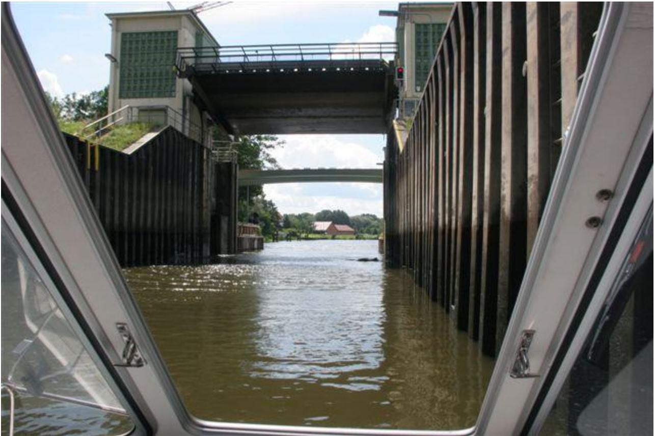
The lock at Hohensaaten lifting us down into German waters.