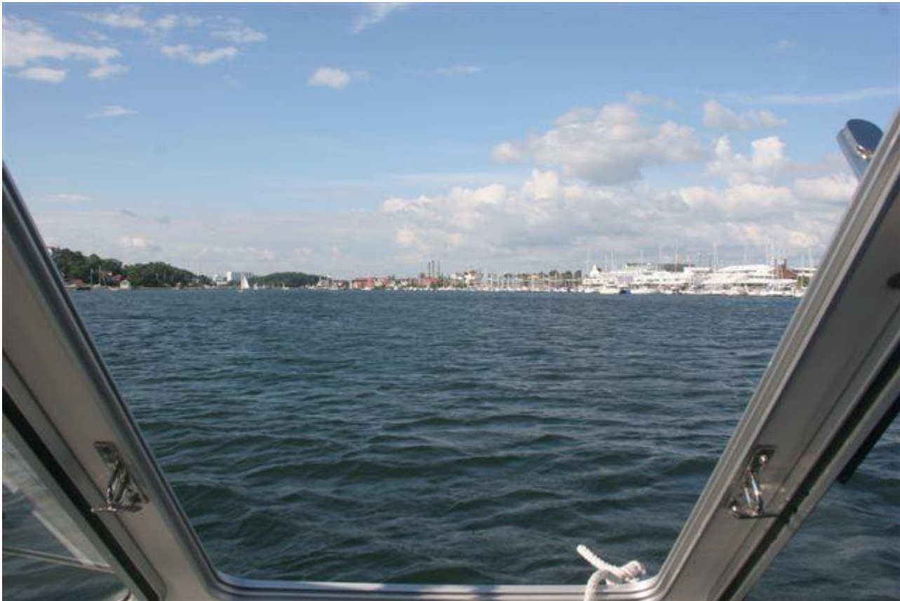
Stenungsund at 1730.