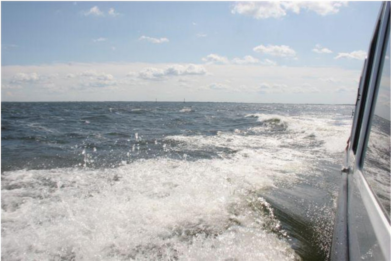
Stettiner Haff at 14 kts