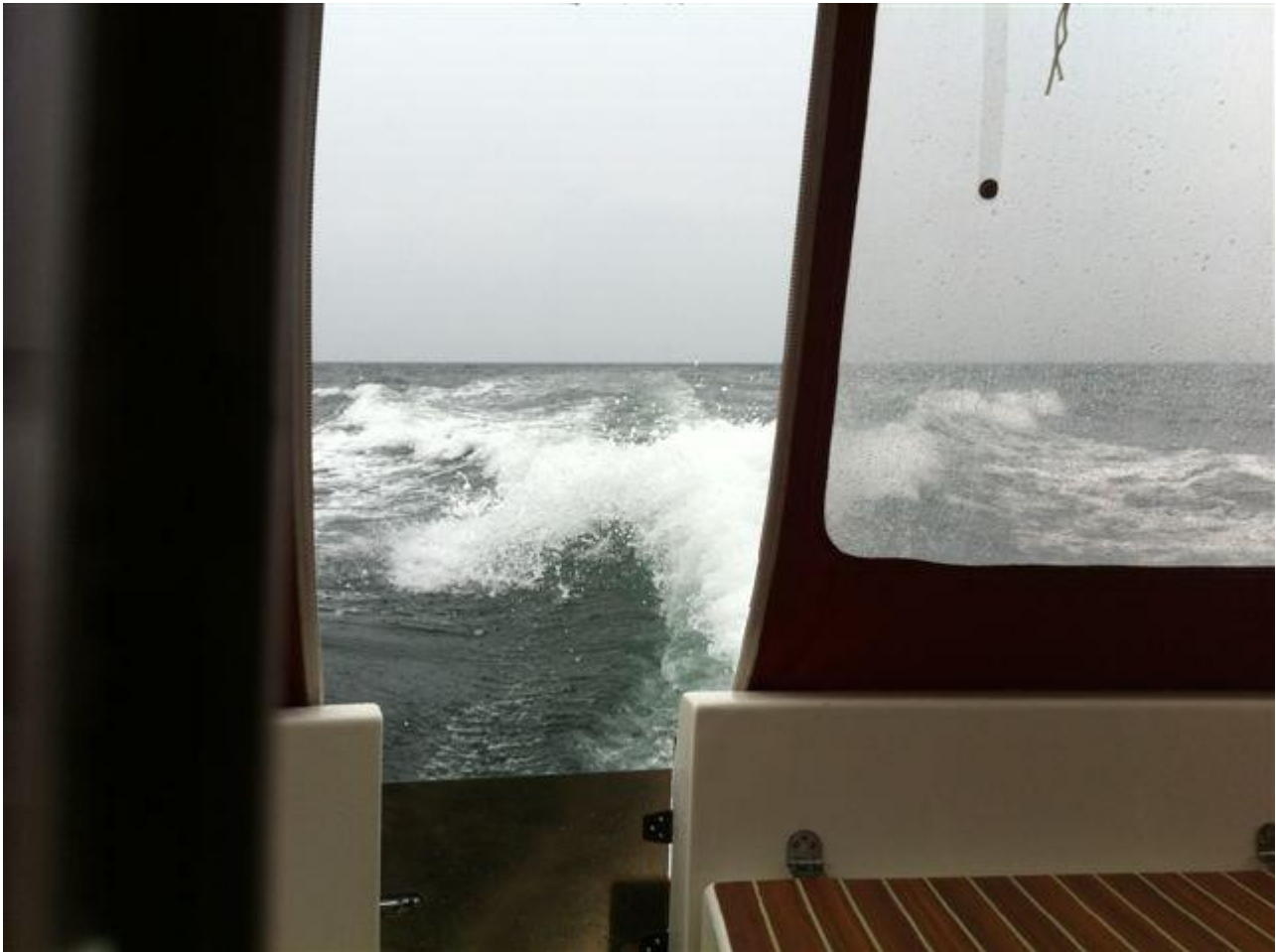
The Baltic Sea

-arriving at Haarbölle, Denmark at 1400 hrs with south westerly wind 4 bft. and drizzle.