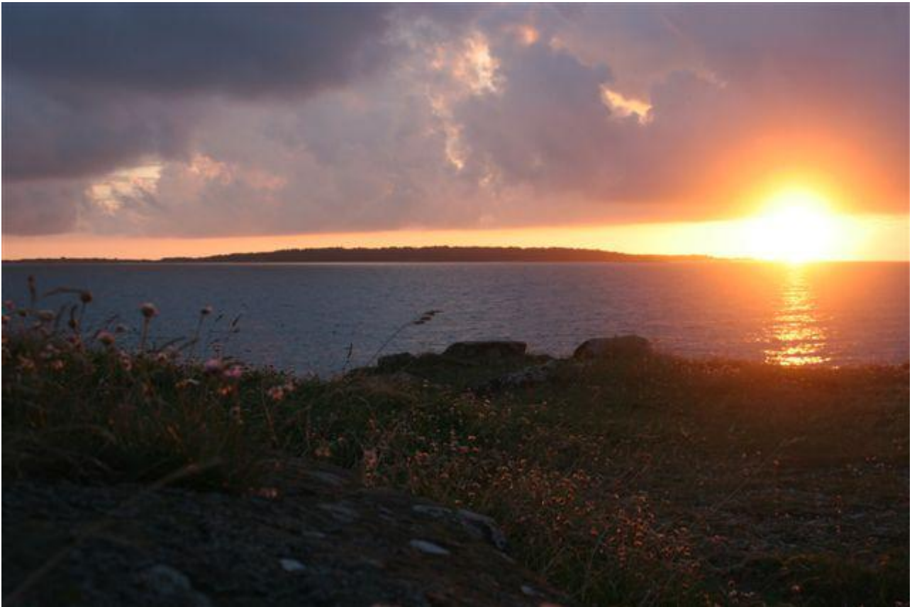
Sunset over Hallands Väderö

On July 22nd my family joined me in Torekov and today, the 24th we left early in the morning to go out to Hallands Väderö and make a much needed break for some days in this fabulous place.