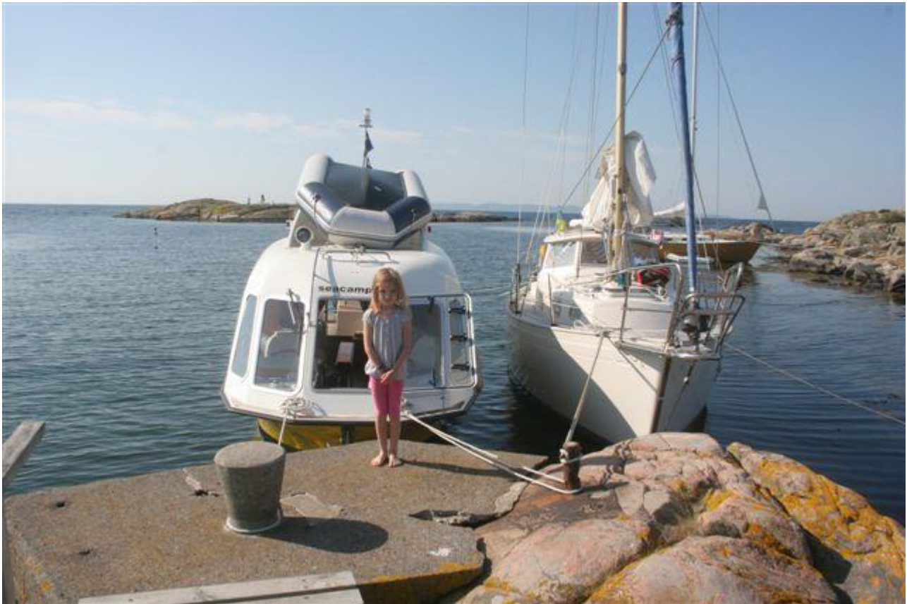
The Seacamper in Hallands Väderö