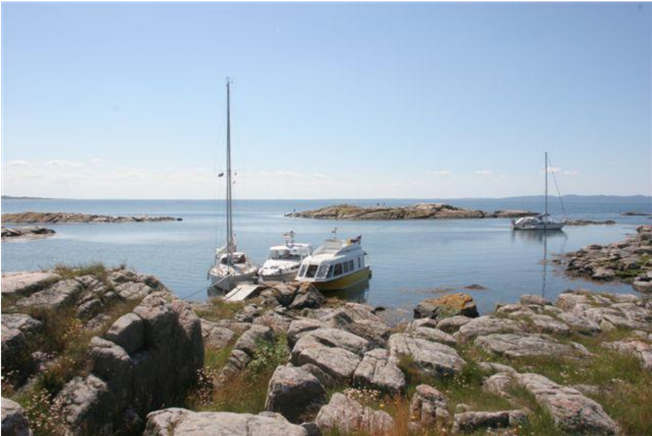
Kapelhamn, Halland's Väderö.

I am back in Torekov after a marvelous day in excellent company! !