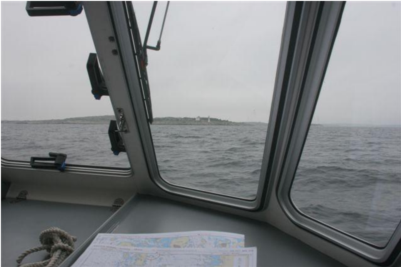
“Valö” light house

indicating that I have now reached the archipelago of Bohuslän with it's 1000 islands!