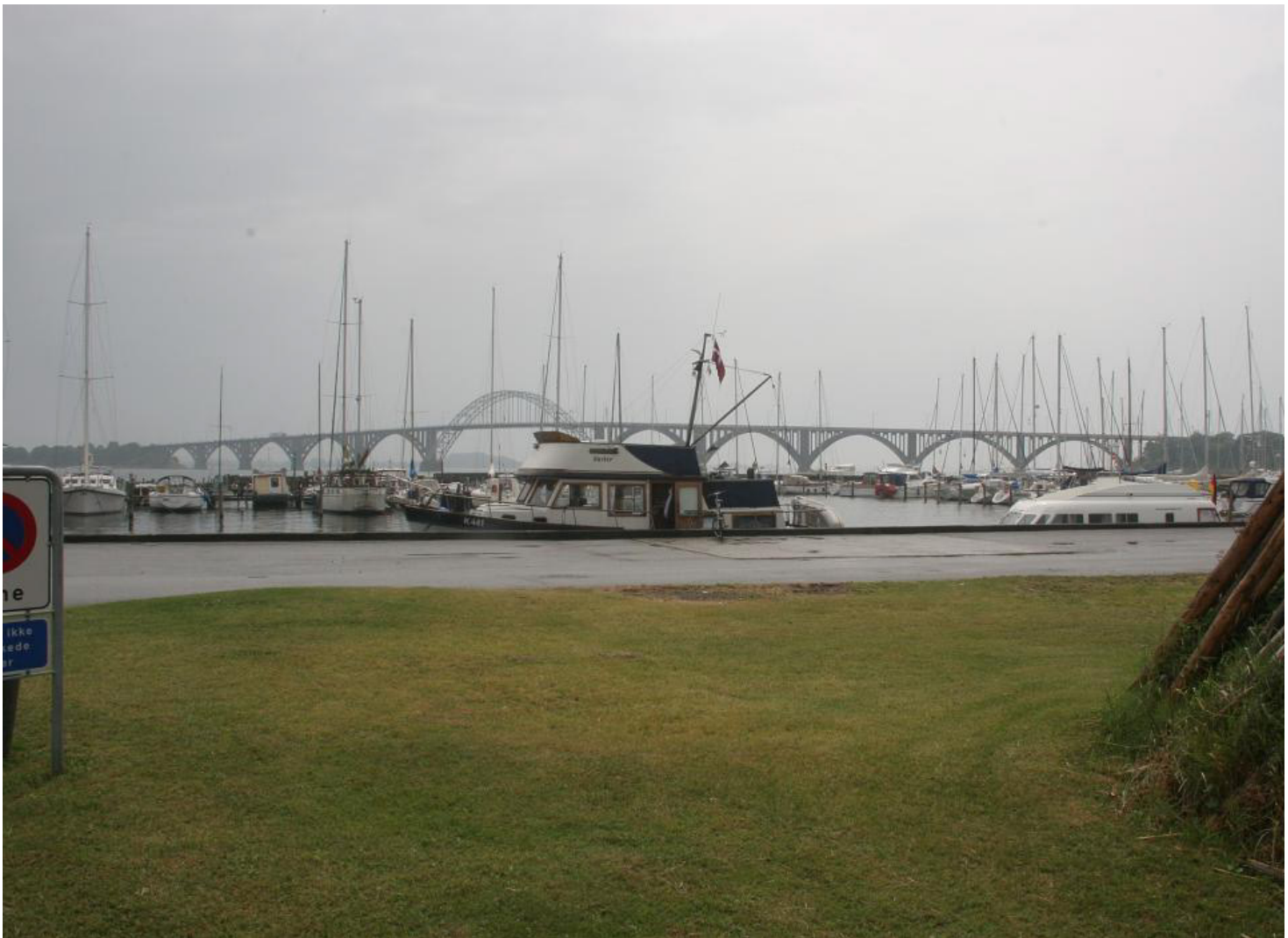
Kalvehave in the rain

the rain stopped at 2 o'clock in the afternoon and a bit of sunshine came through.