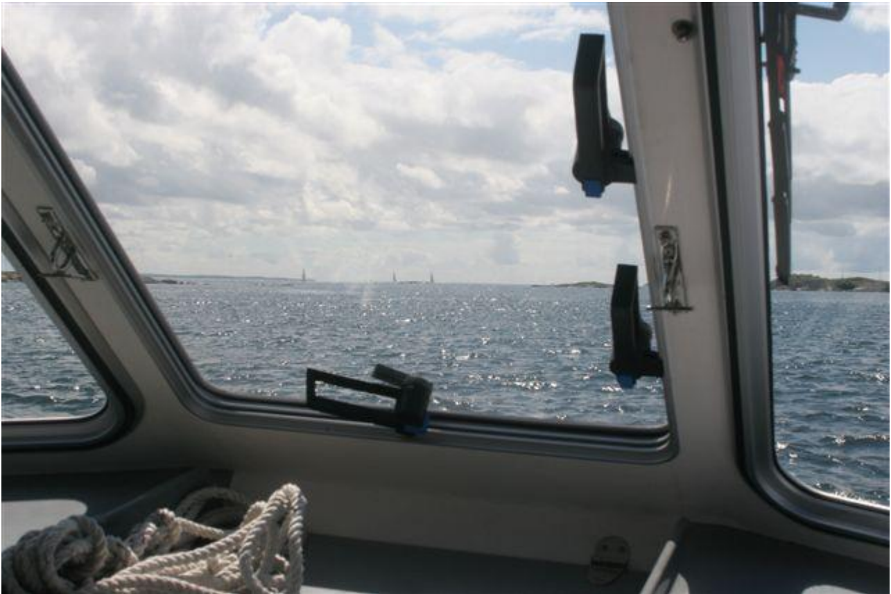
View to the south

Yesterday around noon I left Donsö in fine weather.