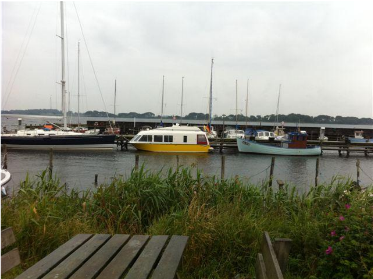
Haarbölle in the rain

Today, June 28th, the Seacamper 810 left Haarbölle at 1600 hrs,