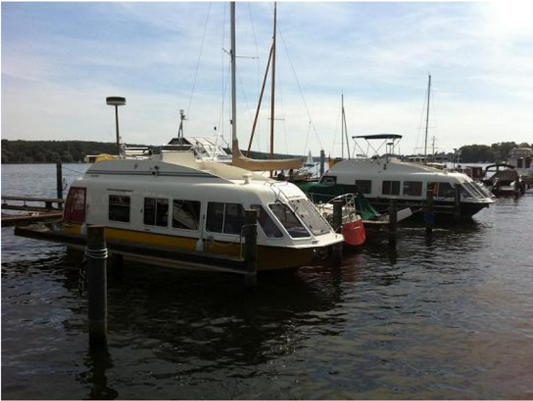
Final destination: Marina Lanke Berlin.

- where we arrived safe and sound on August 9th in the afternoon, after 7 weeks of challenging, thrilling, wonderful cruising from Berlin through Poland, Denmark and Sweden to Norway and back with our capable and comfortable Seacamper 810.