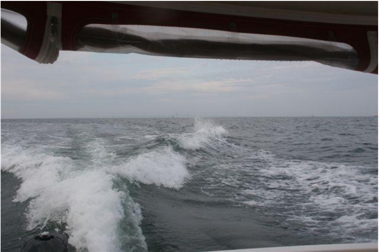
Leaving Copenhagen behind at 15 kts.