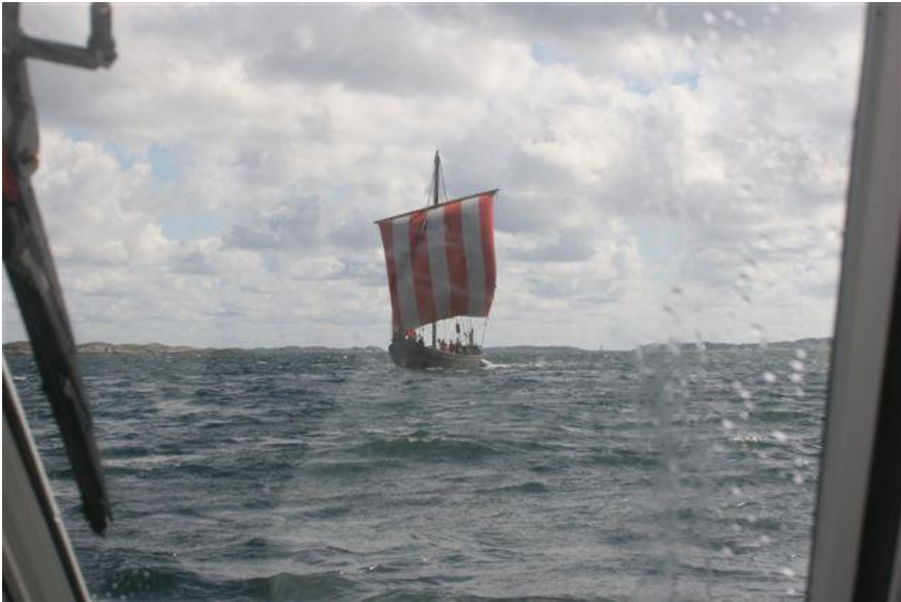
Meeting between the islands

- and then the shortest distance over to the protecting Koster islands. At the south tip of the islands I can cross again to the east with a comfortable before the beam. Well comfortable is an exaggeration,