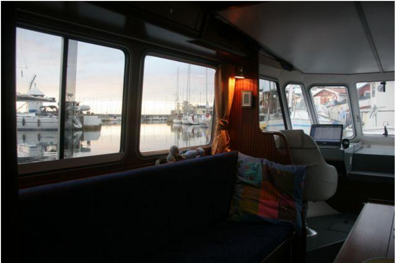
Evening in Torekov