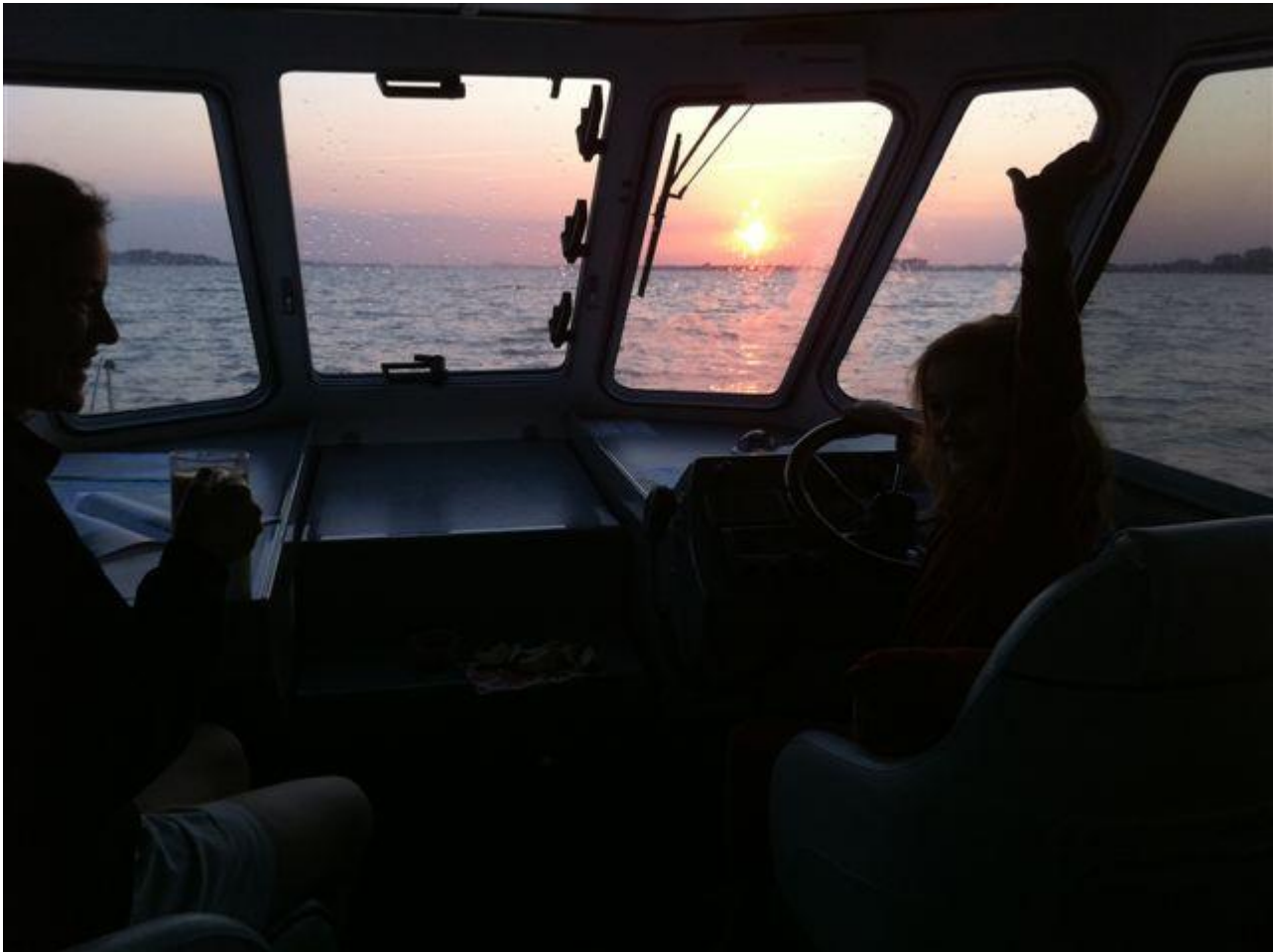
Hannah at the wheel

24.06.2012 at 1000 hrs, we left Stralsund, after having cleaned all fuel filters and checked the oil.