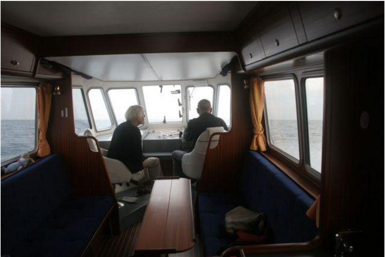
Two elderly mariners at the helm.

From here we set over the Baltic Sea the 6th and arrived after a fine cruise in middle winds at Stralsund in Germany at 1430hrs.