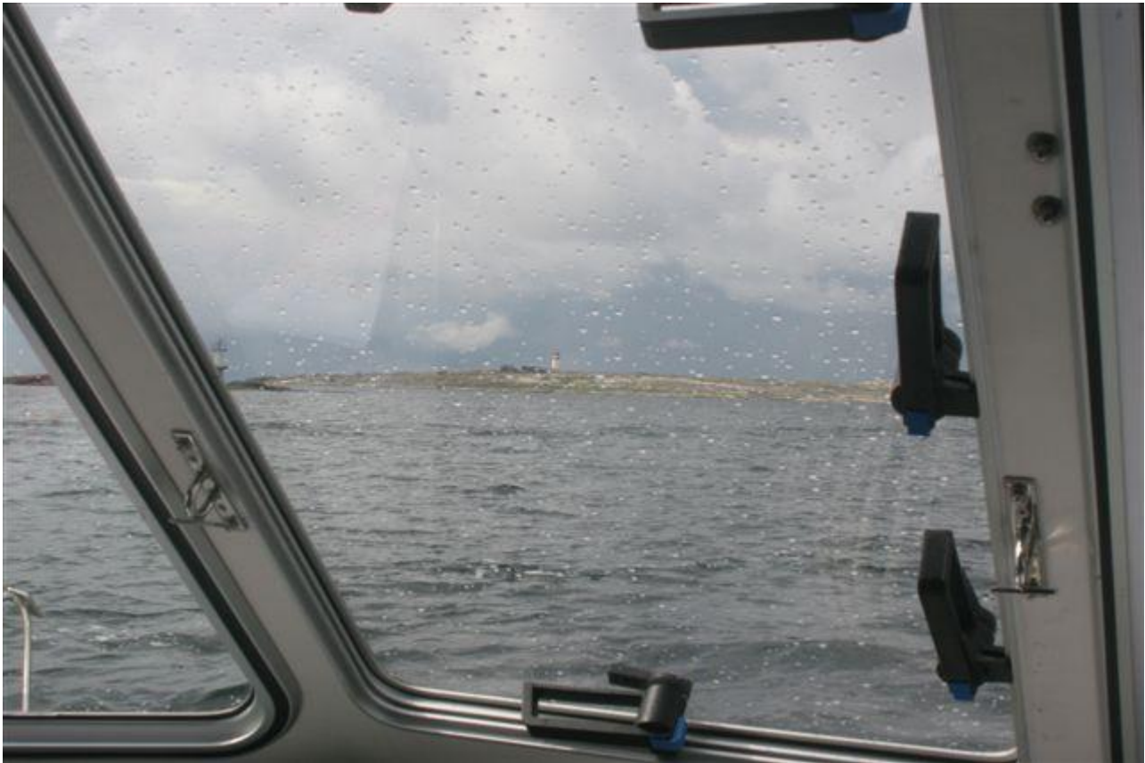
Haallö light house - Smögen

- had lunch in Fjällbacka after passing some narrow waters,