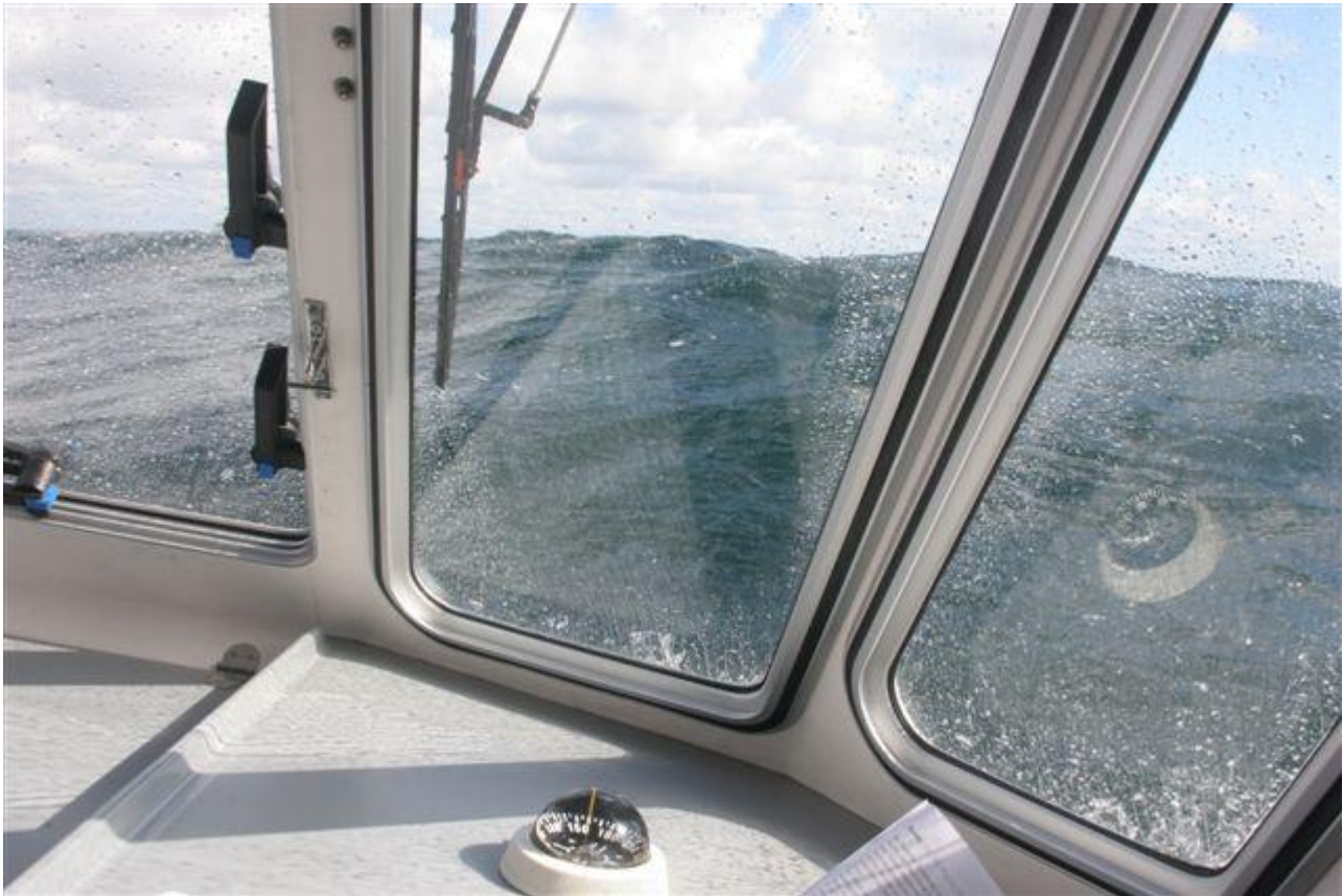
7 kts through the waves

- but I got over well and found my way into the skerries again, just north of Havstenssund.