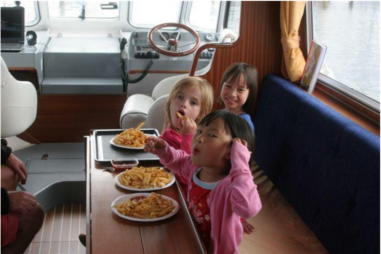
Kids visiting in Hornbäk.