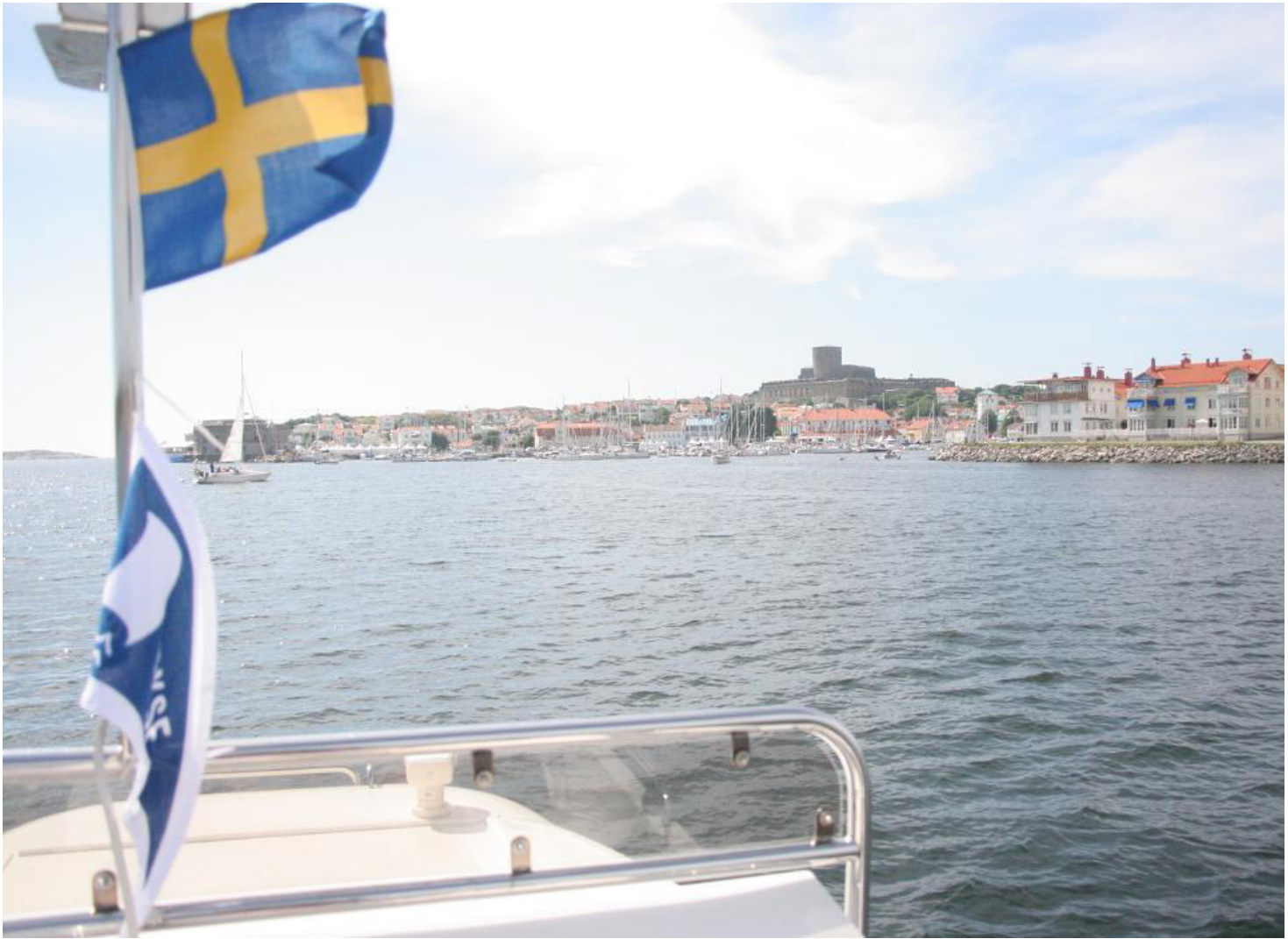
The old fortress in Marstrand